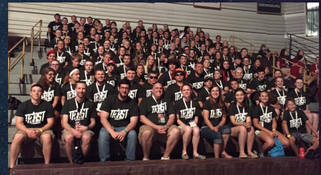
The annual Steubenville Youth Conference